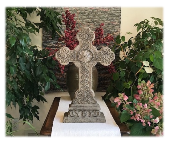
THE GARDEN OF THE HEART Rooted and Grounded in Love

Second Saturday Teaching Healing Prayer Clinics and Retreat